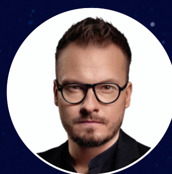
StyleItaliano Active Member